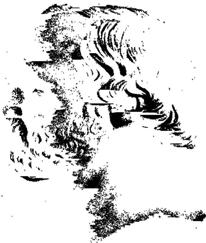
WILLIAM DWIGHT WHITNEY 1827-1894