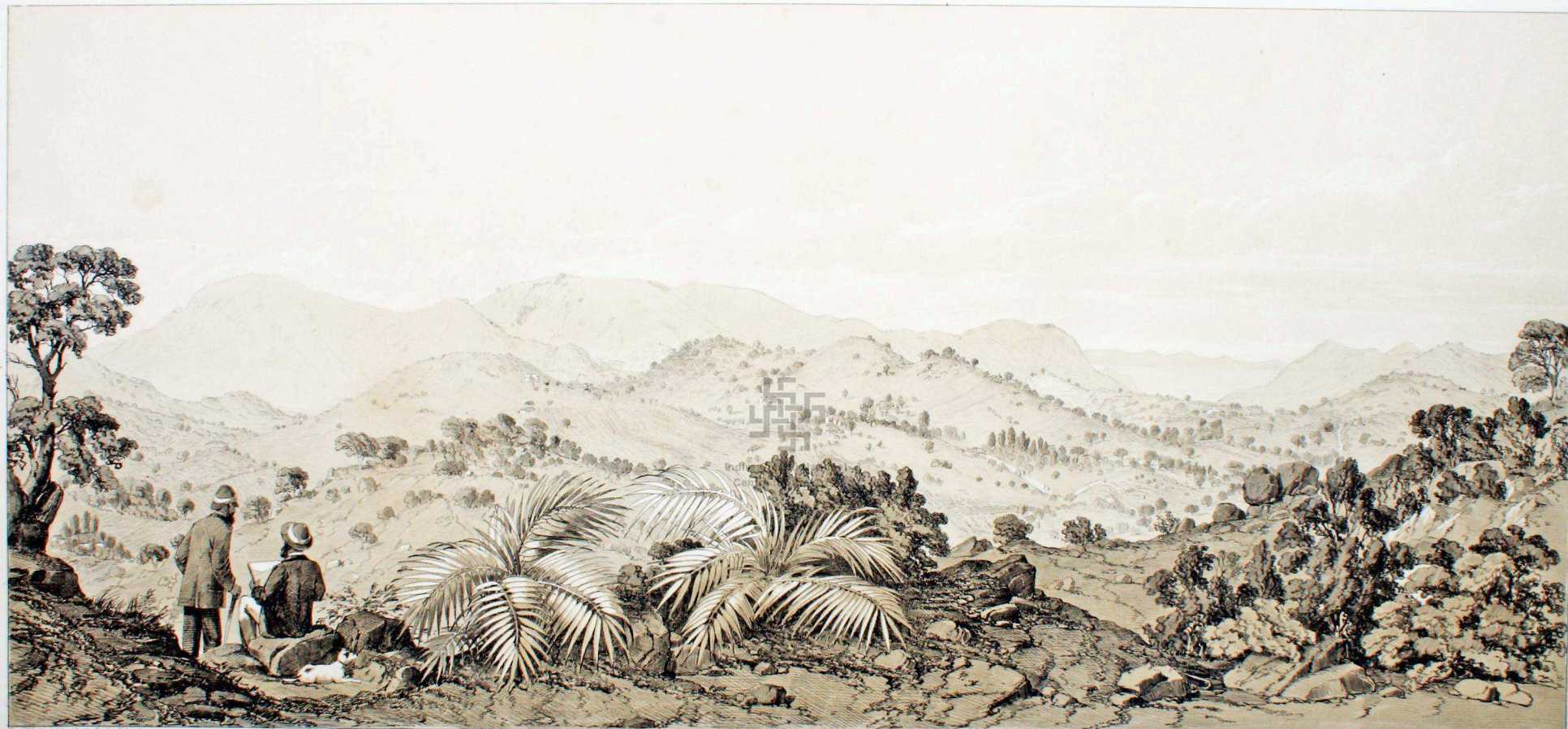
PANORAMIC VIEW OF YERCAND AND THE GREEN HILLS TAKEN FROM FISCHERS HILL