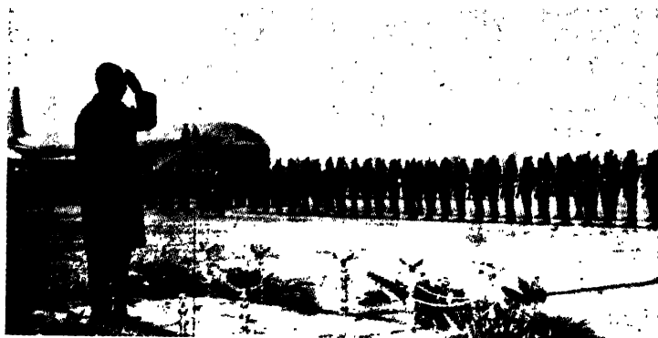
Sheikh Mujibur Rahman taking the Salute of the guard of honour in New Delhi