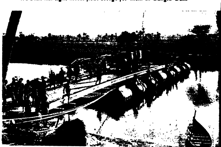
We built this light metal float bridge for them in Bangla Desh