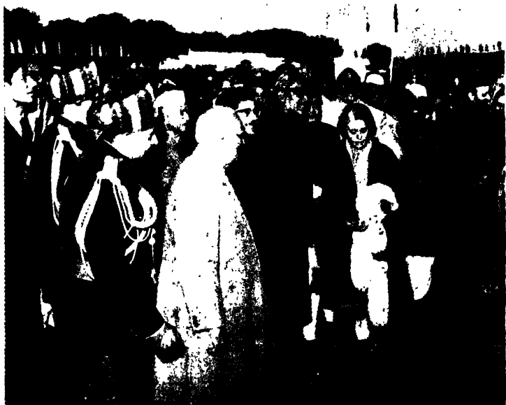
The Bangabandhu with Indian leaders