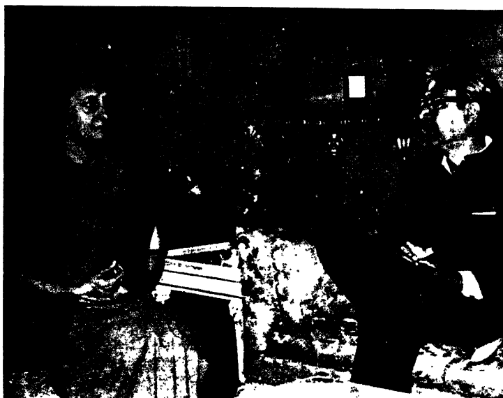
Mrs. Indira Gandhi with Sheikh Mujibur Rahman