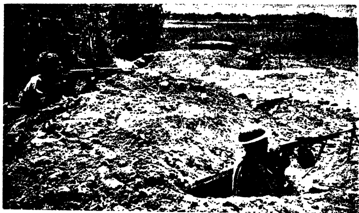
Men of the Bangla Desh liberation force on the alert