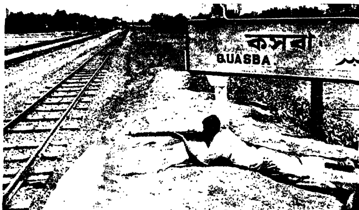
Bullets for the butchers