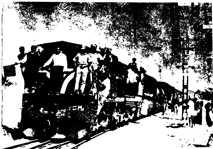
"A Joy ride" in the enemy territory

Supporting the cause : Friends of Bangla Desh hold a rally outside the Pakistani High Commission