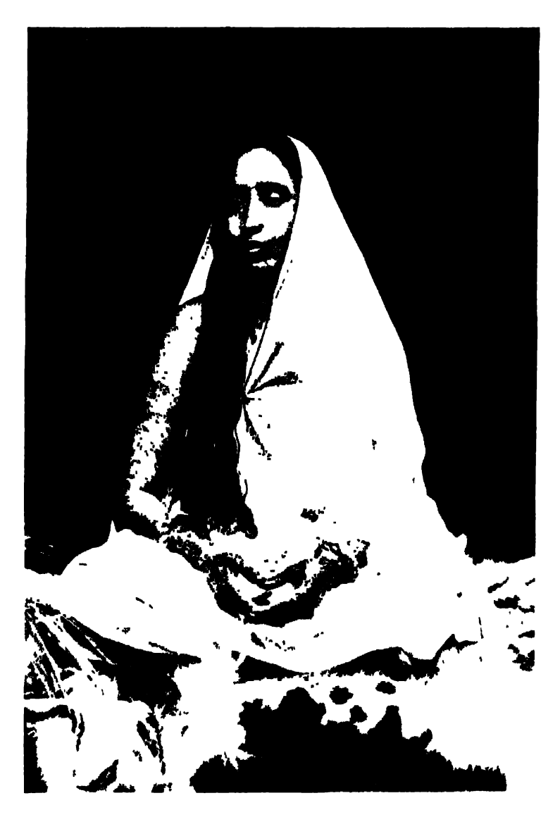
Srı Sarada Devi