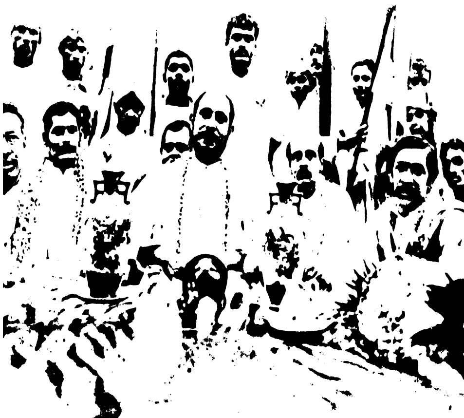
Sri Aurobindo (extreme right) at Uttarpara on the occasion of his historic speech