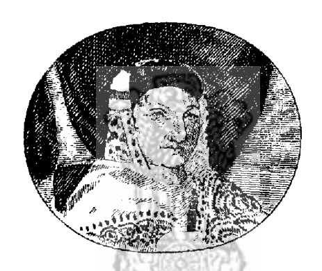
THE BEGUM SOMBRE.