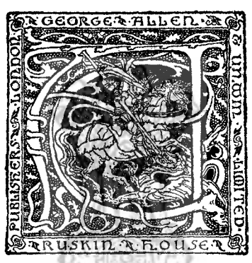
GEORGE ALLEN & UNWIN LTD LONDON: 40 MUSEUM STREET, W.C.I CAPE TOWN: 73 St. GEORGE'S STREET SYDNEY, N.S.W.: WYNYARD SQUARE AUCKLAND, N.Z.: 41 ALBERT STREET TORONTO: 91 WELLINGTON STREET, WEST