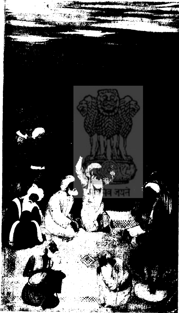
THE POET SADI LISTENING TO A SINGER.