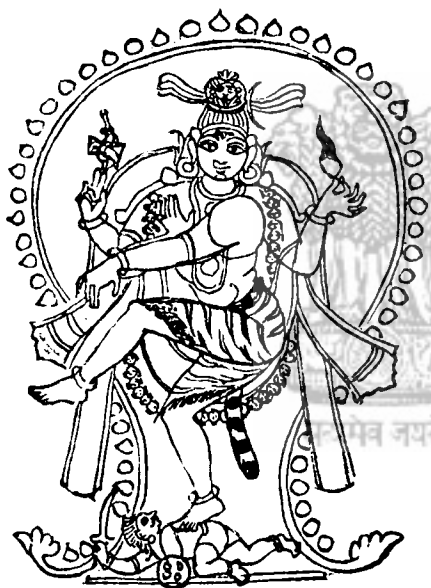
Fig. 1. Natarāja, "dancer in the hall of Southern Tillai."—(Manikka Vacagar) from a Tamil craftsman's notebook (early XIXth century).

Purāṇam , and is familiar to all Saivites. Siva appeared in disguise amongst a congregation of ten thousand sages, and in the course of disputation, confuted them and so angered them thereby, that they endeavoured by incantations to destroy Him. A fierce tiger was created in sacrificial flames, and rushed upon Him; but smiling gently, He seized it with His sacred hands, and with the nail of His little finger stripped off its skin, which He wrapped about Himself as if it had been a silken cloth.