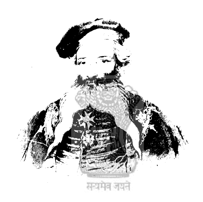
GENERAL ALLARD, ORGANISER OF THE SIKH CAVALRY.