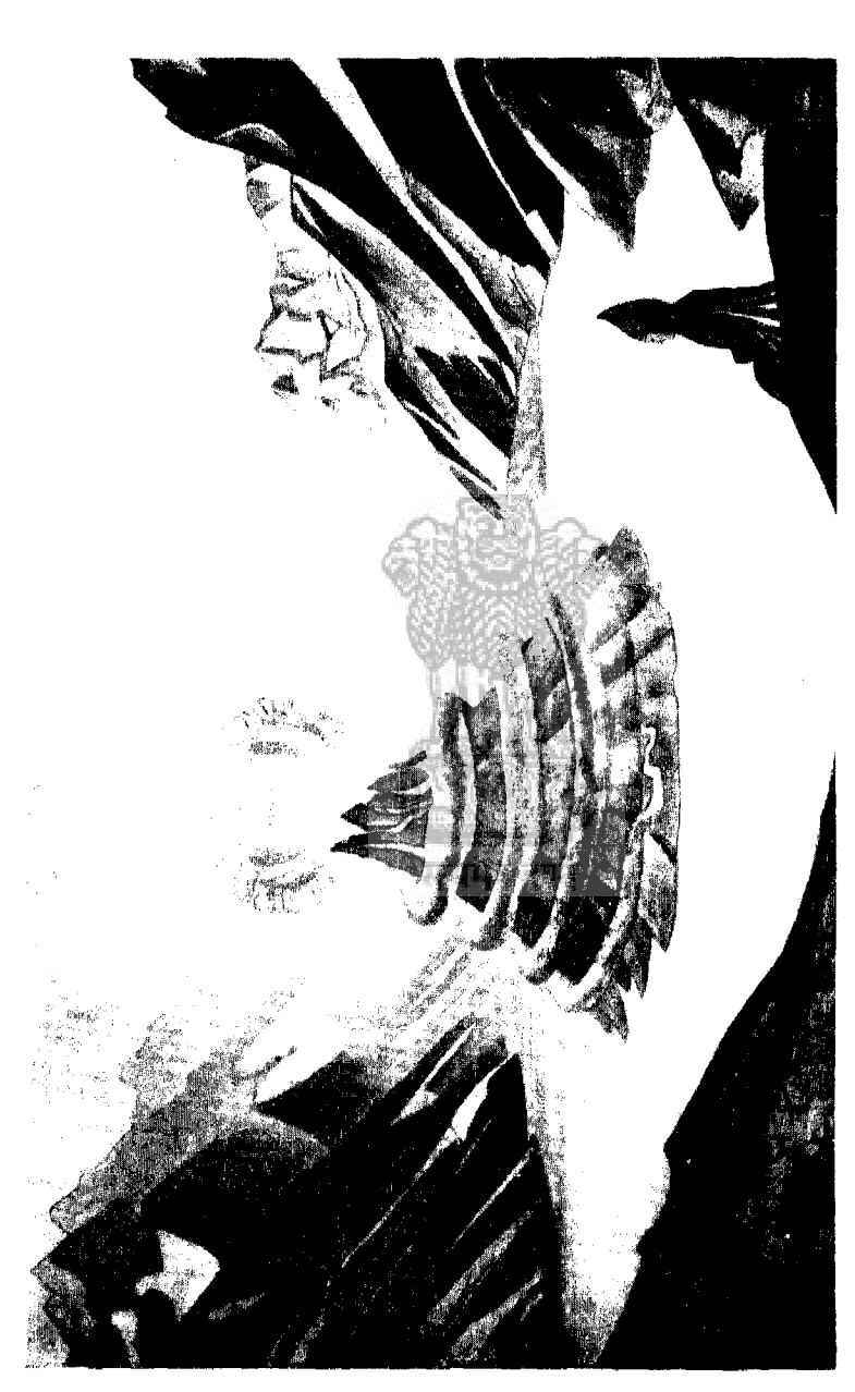
NACARITONAL THE CONQUIROR OF THE SERPENT BY A TABLE OF SECTION NEWS TORSES.