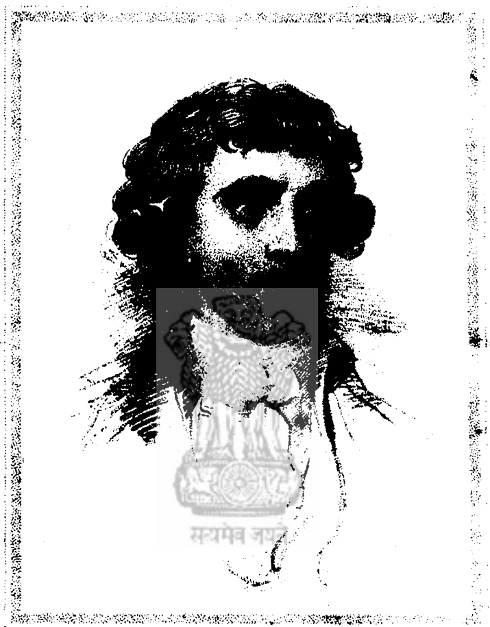
SIR WILLIAM JONES KN T ÆTATIS 47