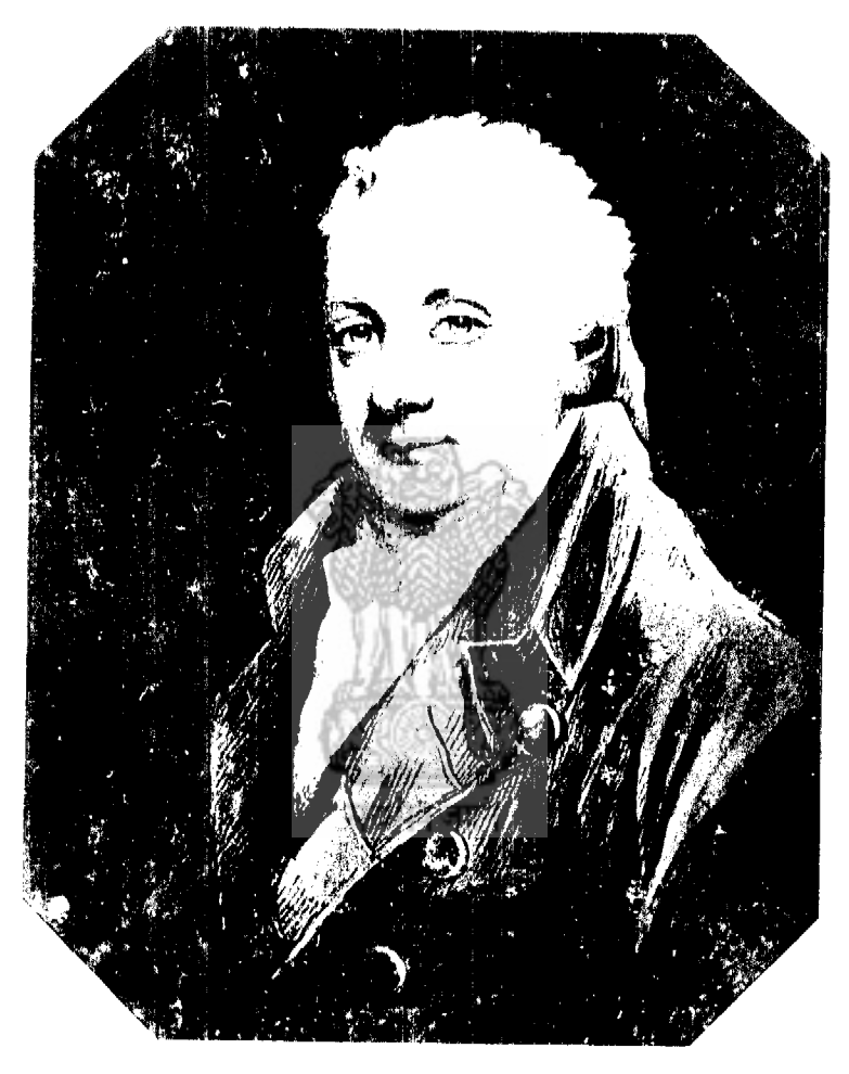
SIT. THEOPHILUS METCALFE, FIRST BARONET